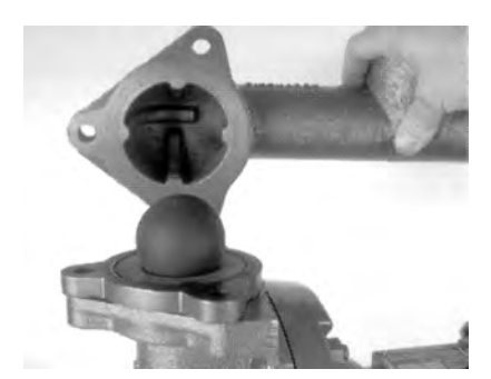
Ball check valve.