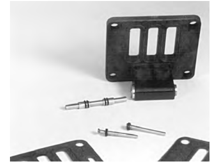
Pilot valve spool and o-rings.

For more detailed information on these accessories, contact your local Warren Rupp Factory-Authorized Distributor, or Warren Rupp corporate headquarters.