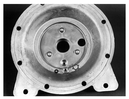
Bushings and o-rings.